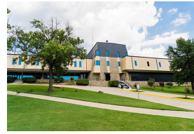
Nursing and Engineering Complex (NEC)

If you're looking for a job or a new career in Education, don't miss the 2022 Education Fair . Come to the auditorium in ORU's Nursing and Engineering Complex (81st and Delaware) on Friday, April 22, between 10:00 and 11:15 a.m. More than 30 recruiters from Oklahoma, Texas, and Colorado elementary and secondary schools will be on site. Dress to impress and bring your resume!