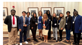
ORU's 2022 Model UN Team

ORU's Model United Nations (MUN) team continues to excel. They've been named an "Outstanding Delegation" for the last three years in two different conferences. At the Feb. 23-26 Midwest MUN conference held in St. Louis, MO, the team represented the countries of Canada and Norway in simulations of situations that come before the UN General Assembly. Their efforts earned them three "Outstanding Delegation" awards and two Honorable Mentions.