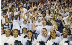
HALL OF FAME TICKETS