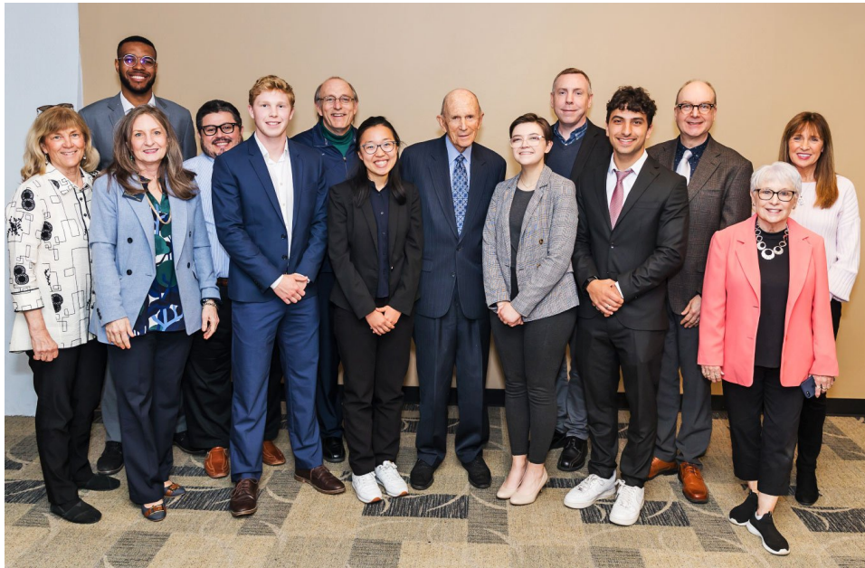
Dr. Kenneth Cooper (center) with students and faculty

Dr. Kenneth H. Cooper, the “Father of Aerobics,” was at ORU on April 8. He spent time in the Aerobics Center (which bears his name) and met with students and faculty to discuss a research project. While on campus, he was also honored by the College of Science and Engineering with a Hall of Fame award.