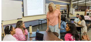
College of Education class in session.

team, 95-62. We're already thinking about Homecoming 2023 and hoping you'll be with us for that November 9-11 weekend. Put those dates on your calendar now!