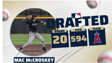
Mac McCroskey (shortstop), Los Angeles Angels